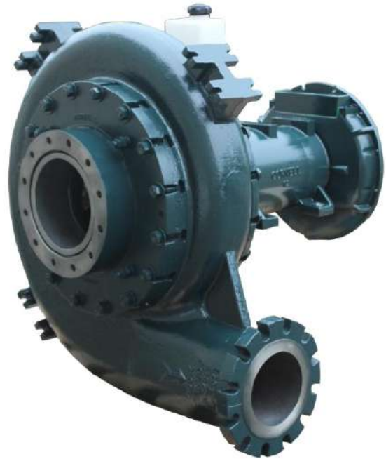
A typical picture of the pump is shown. Please contact StarTech Pump Company for further details. All information is approximate and for general guidance only.