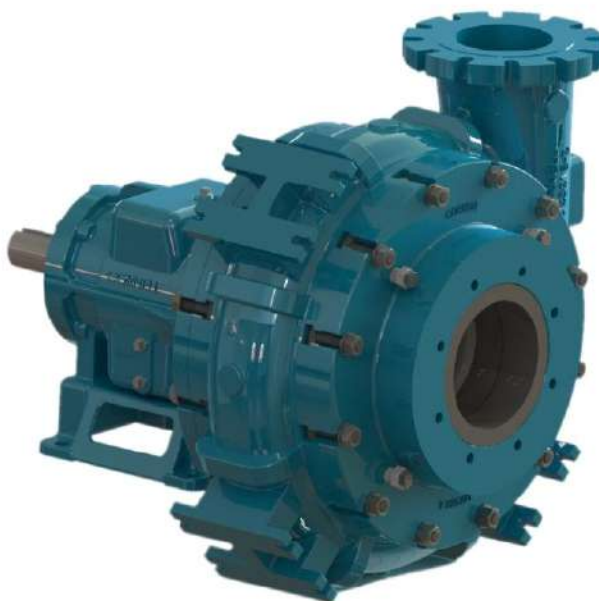
A typical picture of the pump is shown. Please contact StarTech Pump Company for further details. All information is approximate and for general guidance only.