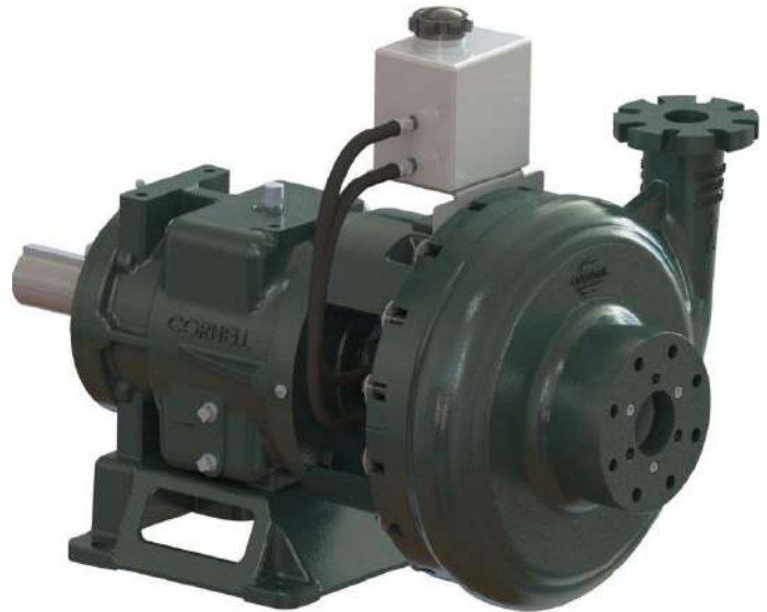
A typical picture of the pump is shown. Please contact StarTech Pump Company for further details. All information is approximate and for general guidance only.